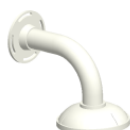
Wall-mount bracket DTS-09C